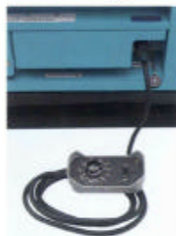
Remote Control Unit